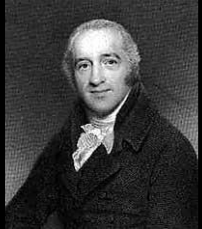
18 th century clergyman Charles Simeon